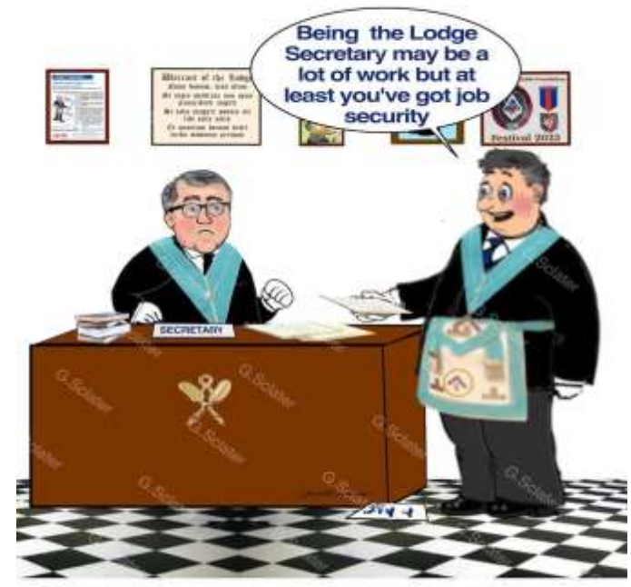
To those who understand, no explanation is necessary. To those who cannot, no explanation is possible